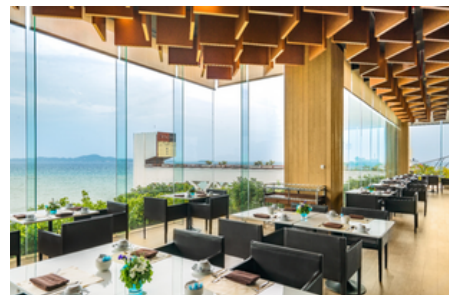
Panorama - A Taste for Every Palate