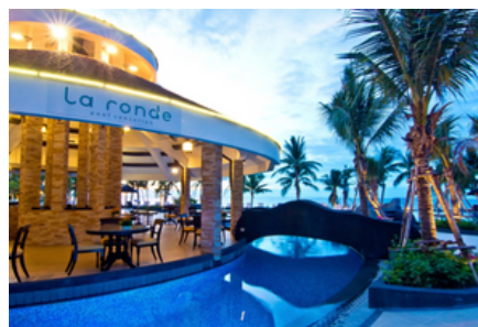
La Ronde - Pool Sensation