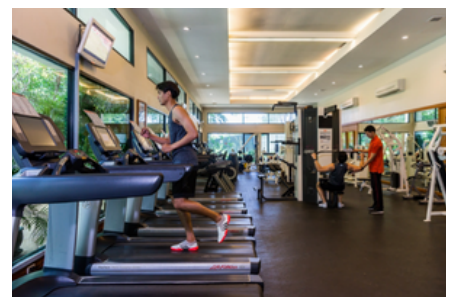
FITZ Club - Racquets, Health & Fitness