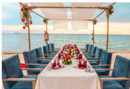
Dinning by the Sea