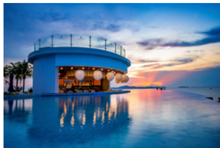
Sky Aquarium Bar