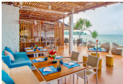
Breezo - Be Yourself Dining